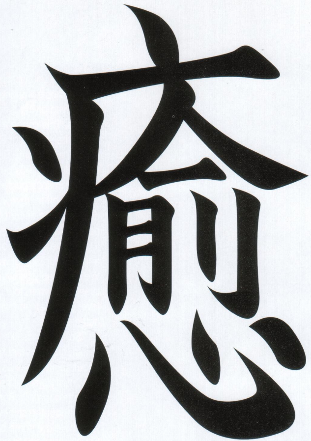
ARTWORK BY HEIKI ICHIKAWA

The indigenous Japanese culture strongly features Kami, Divine Spirits, with Kami being an important aspect of Shintoism. These Divine Spirits inhabit the natural world and may include the spirits of natural elements such as water, rock and earth and qualities such as fertility. These ancient Japanese interpretations of the world still play a major role in contemporary Japanese culture. To communicate with a Kami, you are required to become a Kami. It is only